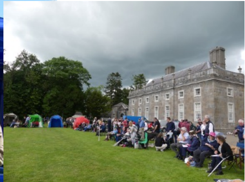
Irish Wolfhound Ch Breed Show Castletown House Patrick Fortune ICP 2019